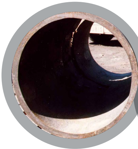
Pulverised Fuel Pipe